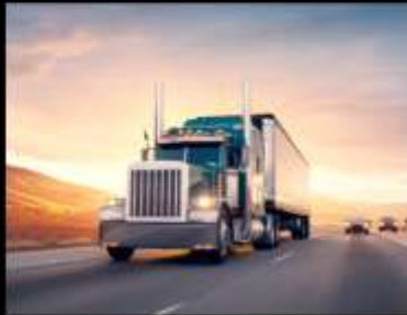
Transportation & Logistics