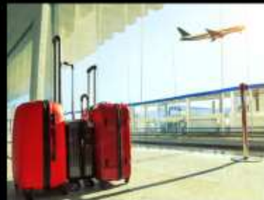
Travel & Hospitality