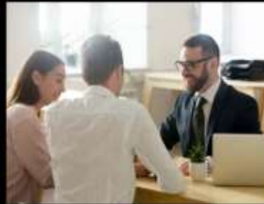
Banking, Financial & Insurance Services