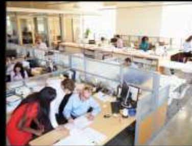
Government & Public Sector